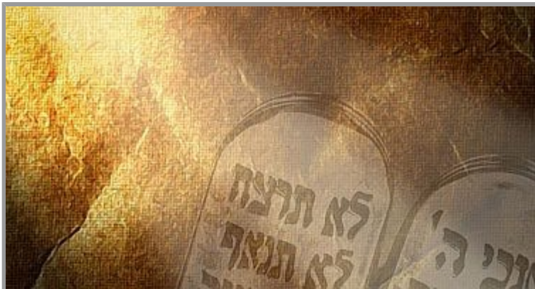
...the Ten Words of the Father

Words mean things. If we are to worship the Father in Truth, if we are to walk in the Power of the Present Presence as Yeshua said we would - perhaps we should give more attention to Whose Words we are heeding. Are we listening to the religious words of man's tradition cloaked in subtleties? Or, are we giving more weight to the Words coming from Yeshua's lips that point us to that Truth? What they actually say and what they actually mean - instead of dismissing them because they don't line up with someone else's theology.