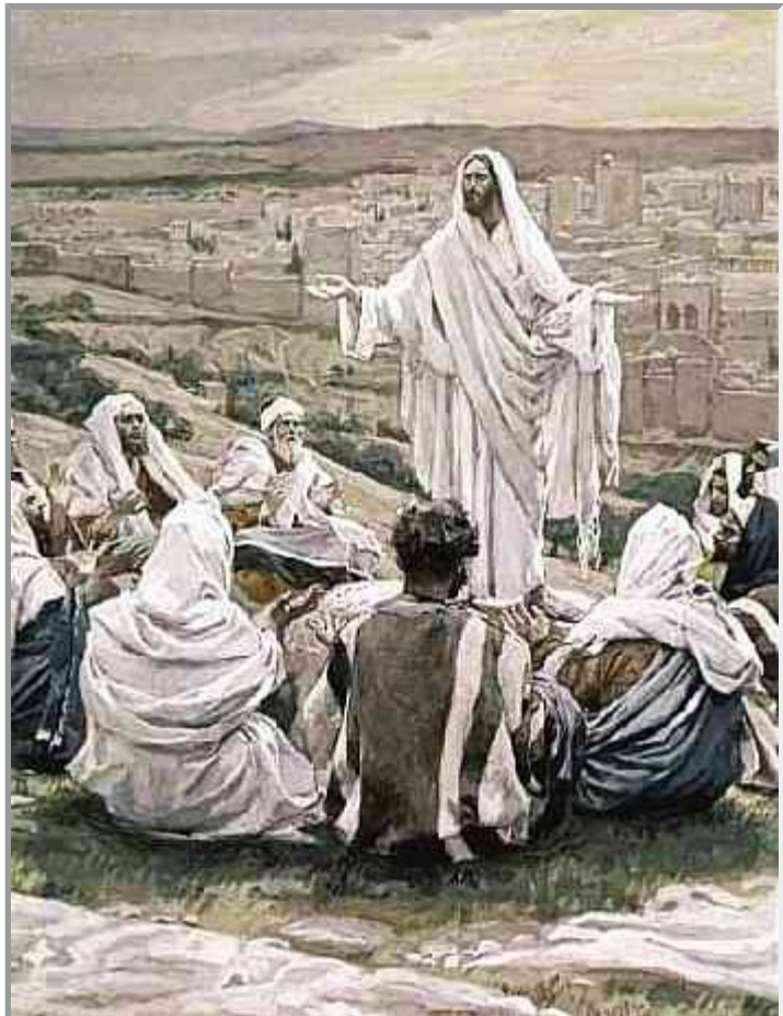
...listening to Yeshua's Words

Listen to what He says in John 14:21-24 (in particular v24) above. He says here and again in John 12:49-50 that He ONLY SPOKE THE FATHER'S WORDS . What words was He speaking of? Not His. There is only one verse in all of scripture where He gave us a NEW commandment - and that was just an expansion of Leviticus 19:18 . I challenge you to find where scripture specifically states He gave a NEW set of commandments. As much as we have been asked to believe otherwise - they are just not there. Everything He spoke of can be referenced back to the Original Book, from the Father's Words - because He ONLY spoke of the Father. EVERY ONE of the Beatitudes originate in the Original Writings. The commandments He spoke of were the Father's commandments. And, if that were not enough, "the apostle of grace" said the same thing in Acts 24:14 , Romans 2:13 , and Romans 3:31 to name but just a few. The same is being said in 1John 3:24 (reference what it means to be Under the Law for a more detailed explanation). If there is no contradiction in the scriptures - then, what do we do with all of these verses all taken from the New Testament? Ignore them? Pretend they don't exist? Rationalize them away because we don't want to do them? Or do we try to find the commonality between them and what the rest of scripture teaches? Why is this so important?