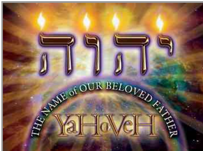
...the Beauty of His Name

Just how, then, did we get to the English name "Jesus" if His Name given at birth was the Hebrew "Yeshua"? Remember that the English language had not yet come into existence at the time of His Birth. Just as the English language evolved out of Greek and Latin underpinnings, so has the name "Jesus" evolved. Linguistically, however, there is a problem with the English letter "J". There is no comparable letter or sound to be found in either the Hebrew, Aramaic, Latin or Greek languages that even remotely resembles the English letter "J". In fact, the letter "J" did not even appear in the English language until the mid-17th century. The evidence of this fact can be found in both the original 1536 version of the Tyndale Bible and 1611 version of the King James Bible where there is no "J" letter to be found in the