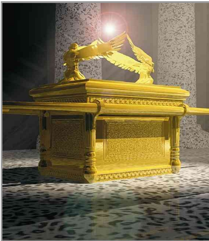
...the ark of the Testimony

"And Moses said unto Aaron, Take a pot, and put an omer full of manna therein, and lay it up before YaHoVeH, to be kept for your generations. As YaHoVeH commanded Moses, so Aaron laid it up before the Testimony, to be kept." Exodus 16:33-34