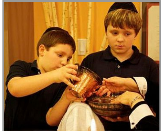
U'rchatz - washing of hands