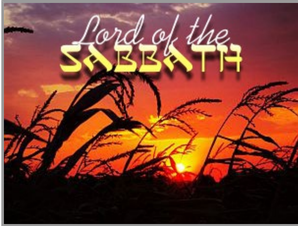
Yeshua is Lord of Shabbat

Sabbath - He did no commercial work on the Sabbath nor did He engage in any commercial activity that would require anyone else to break the Sabbath. There are no restrictions given in the original words that prohibit eating. His disciples in the corn field were merely eating - they were not gathering to sell or to store up. What was violated was the religious tradition of the Pharisees (known as the Oral Law) that had been added onto the original meaning of scripture. This is what He chastened the Pharisaical leaders over - " Is it lawful on the Sabbath days to do good, or to do evil - to save life or to destroy it? " He was rebuking them for the hypocrisy of the manner in which they handled the Sabbath by adding traditions that are contrary to the Nature and Essence of the Father. He never told them to NOT keep the Sabbath - just to keep it properly. In claiming to be Lord of the Sabbath, did Rabbi