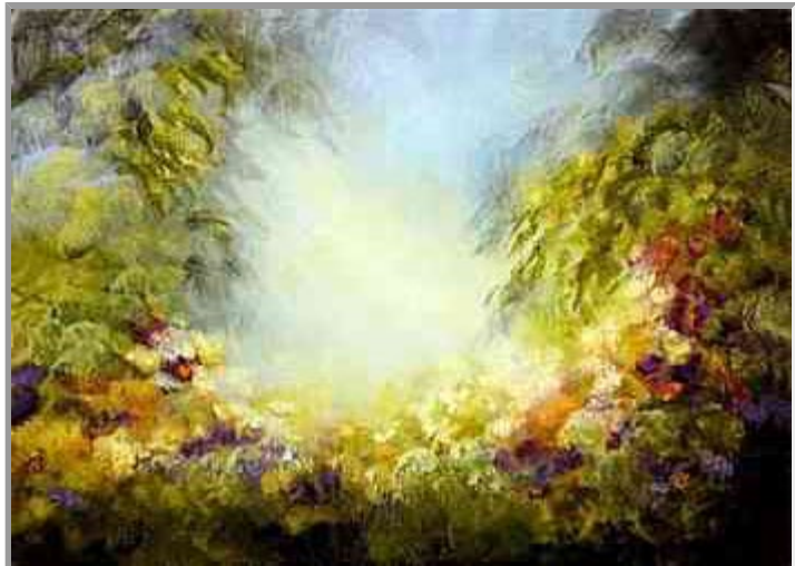
...the garden of delight

Genesis 2 picks up the story but with the focus upon a particular place on the already created earth - the Garden of Eden (v.8 - in Hebrew, gan 'aden meaning "garden of delight"). Here we are even given specific directions about where this Garden was located in the earth (v.10-14) and told of a particular man YaHoVeH had formed there - Adam , the first of the Hebrew people. It was into this particular person YaHoVeH breathed the Breath of LIFE (in Hebrew neshama khah'ee ) - the spark of divine connection. Leviticus 17:11 tells us the Life is in the Blood and it is the Blood that makes atonement (brings us into at-one-ment with the Father) by the Life contained therein. The Life YaHoVeH breathed into Adam was His very Essence - now contained in Adam's Blood. In the same way as my son looks and acts just like me