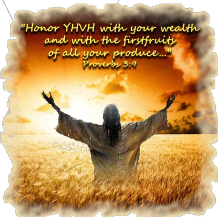
...the sacred offering of firstfruit