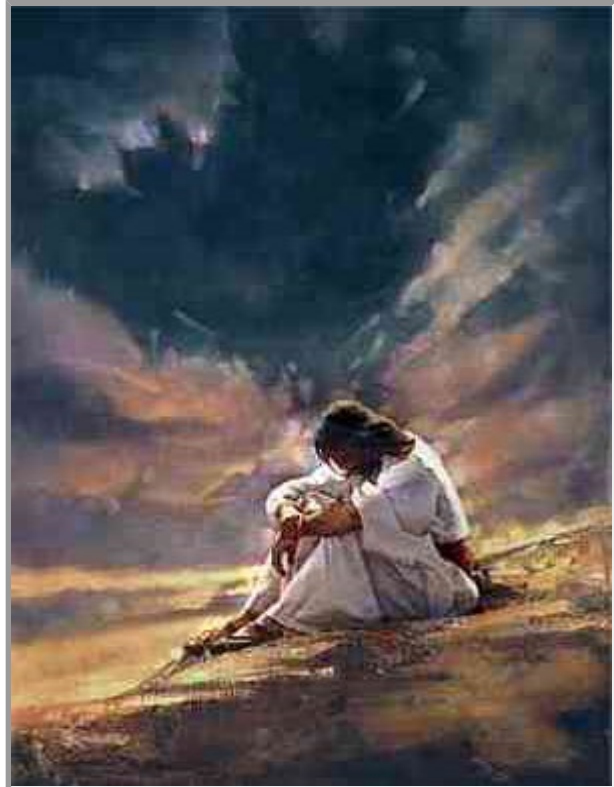
...led into the wilderness

Then the tempter, taking Him up on a high mountain, showed Him all the kingdoms of the world in a moment of time and said to Him, "All this authority I will give You, and their glory; for this has been delivered to me, and I give it to whomever I wish. Therefore, if You will worship before me, all will be Yours." And Yeshua answered and said to him, 'Away with you! For it is written, 'You shall worship YaHoVeH your Elohiem, and Him only you shall serve.' ' Now when the tempter had ended every temptation, he departed from Him until an opportune time and behold, angels came and ministered to Him. (from Matthew 4:1-11 and Luke 4:1-13)