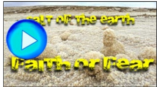
Faith or Fear? - a discussion