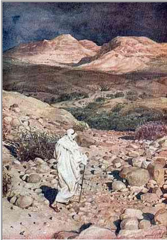
...in the wilderness

Some English translations end this verse with the words "of God", others end it with the words, "of Messiah" ("Christ" is a Greek alteration of Messiah, see Who's Name Is It? for explanation). However, since Yeshua stated in John 14:24 that His words WERE the words of YaHoVeH, it makes little difference which way it is ended - the Word being spoken of IS the Nature of YaHoVeH, the LIFE of Spirit ( John 1:1 ). The Hebrew language is different from English in that it carries a duality of meaning for words and phrases. In Hebrew, the meaning of hearing is not just audio sound waves striking the sensory portion of the ear, but also has a concurrent meaning as well. The Hebrew word for "listen" or "hear" in Exodus 15:26 is shama' - but, in Exodus 19:5 , this same Hebrew word is also used for "obey". In Hebrew, to hear IS to obey, to obey IS to hear. Whether you hear what is spoken or not is measured by how you obey what you hear. Conversely, how you obey determines whether or not you heard what was said. To say "God is good" is to also say "good is God" at the same time - they are the same. This same dualism is also used for the whole phrase in Romans 10:17 above. In considering that all of these words were initially written by Hebrews from a Hebrew perspective, then, Hebraically, this phrase is rendered "faith IS hearing/obeying - hearing/obeying IS faith". The exercise of faith is directly tied to my action of trust, exhibited by obedience to His Words.