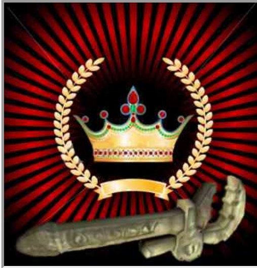
...the crown of Life (James 1:12)

This phenomenon of YHVH working within the confines of man's will is seen throughout scripture but is illustrated pointedly in 1Samuel 8 where it is clear the idea of a physical king was not in the Plan and Purpose of YHVH. HE wanted to be their king. But, they insisted on having a king they could see like the other nations they did battle with. YHVH gave them what they wanted - in spite of the fact that it was not in the blueprint.