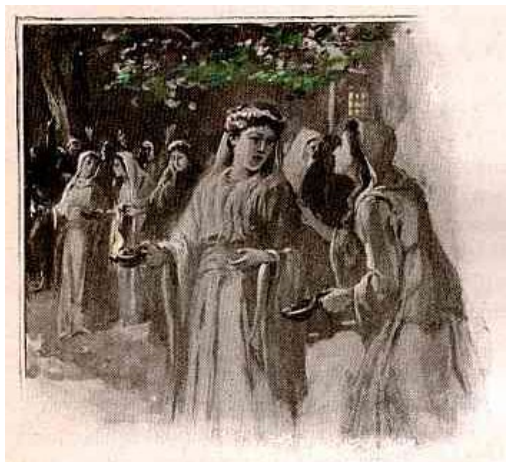
...the ten virgins

There are two very simple questions to ask of this, seemingly, complex doctrinal tradition of man called predestination which has interwoven itself into the fabric of faith. Do I have free will - or not? If the answer to that question is 'yes' - then the next question is: how can it be mine to freely do with as I please if someone other than I has already decided what I do with it - whether that decision be by force, coercion or good intention? And, if YHVH has already decided to whom He will bestow eternal life, then why is it left up to me to decide if I am to be involved or not ( John 17:3 , Matthew 25:1-12 ). By the way, of the five virgins who didn't make it - they were still virgins . Meaning that, even though they chose to remain virgin, their subsequent choice of action (or inaction, as it were) caused them to be left outside the door. So, there must be some correlation to action and being invited into YHVH's Kingdom - or not (visit the article Children of the Bridechamber to see that these virgins, scripturally, are not gender specific).