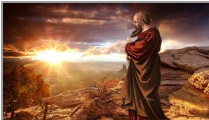
...Ezekiel before the Shekinah Glory of YaHoVeH

"Son of man, these men have set up their idols in their hearts and put the stumbling block of their iniquity and guilt before their faces; should I permit Myself to be inquired of at all by them? Therefore speak to them and say to them, Thus says YaHoVeH: Every man of the house of Israel who takes his idols (of self-will and unsubmitiveness) into his heart and puts the stumbling block of his iniquity (idols of silver and gold) before his face, and yet comes to the prophet (to inquire of him), I, YaHoVeH, will answer him, answer him according to the multitude of his idols, That I may lay hold of the house of Israel in the thoughts of their own mind and heart, because they are all estranged from Me through their idols.