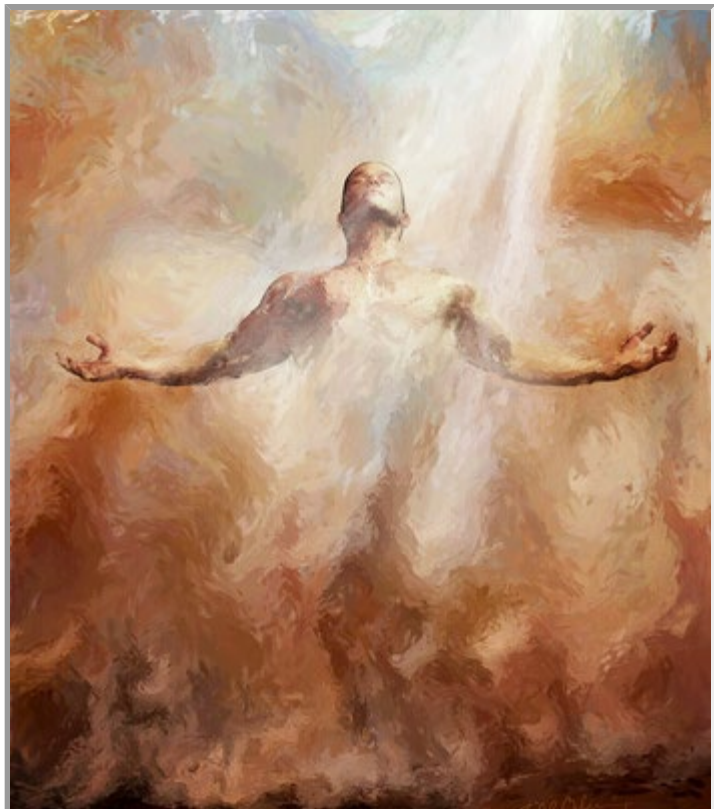
...living in YaHoVeH's Judgment

When we choose to embrace YaHoVeH's judgments willingly, that is what causes us to become righteous before Him ( Psalms 19:9-11 ). By so doing they become a part of us, they become Life to us, they live within us - we carry judgment within us. As we allow that Life to begin to shine through our words and deeds, as Yeshua did, the Father's judgments then become manifest through our life as it was with Yeshua because, after all, it is His Life we are talking about. The darkness of men's hearts we encounter begin to become exposed, placing upon them the responsibility for the choices made on their own behalf - to embrace Light or to remain in darkness ( 2Thessalonians 1:5-6 ). If we walk in the Light of judgment, as He is in the Light - we then can have fellowship one with another because we are walking together in righteousness. That Light shines through the Body of Believers congregated around us within whom He Lives. If we are to stay on course, we need one another. With all our faults, with all our short-comings, with all our idiotness - we need one another if we are to stay free of deception.