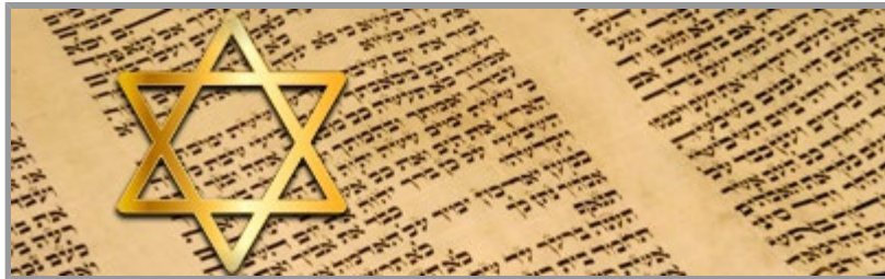
...words of righteousness

want from the core of our being to be His Kingdom He intends to establish here on this earth through the one new man born of the consummation of the marriage of the Body and the Bride - then citizenship in that Kingdom is ours. But if He finds our eyes, our desires, and our affections fixed on the stuff that is passing away, our own desire to not suffer the wrath of the