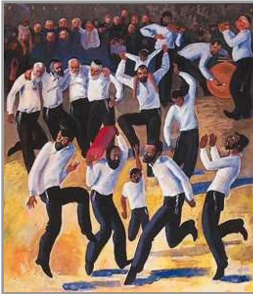
A Wedding Celebration

Matthew 7:21-27 is the culmination of a dissertation Yeshua began speaking to His disciples beginning in Matthew 5:1 . There are many called to come to the wedding feast, but only those who are clothed in the proper garment of righteousness will be allowed to attend ( Matthew 22:1-14 , Isaiah 61:9-11 ). Garments are something scripture tells us we "put on" and "take off" by the choices we are empowered to make through ruach ha kodesh (reading right to left is Hebrew for " the holiness of spirit ") which many have incorrectly come to believe is simply a substitute for the English "Holy Spirit" appearing in their bibles. Genesis 15:6 tells us that Abraham simply believed the Father for Who He said He Was and it was accounted to him as righteousness . This English word believed is translated from the Hebrew word aman and means to support, confirm, to be faithful, to establish by standing firm . In the parable of the ten virgins the English word virgins comes from the Greek word parthenos and means someone who has abstained from all uncleanness and whoredom attendant on idolatry, one remaining chaste . These virgins are not gender specific . We commonly think of virgins as being female, but Revelation 14:4-