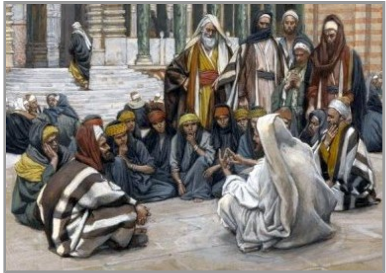
...friends of the Bridegroom

"He that has the bride is the bridegroom: but the friend of the bridegroom , which stands and hears him, rejoices greatly because of the bridegroom's voice: In this my joy therefore is fulfilled." John 3:29