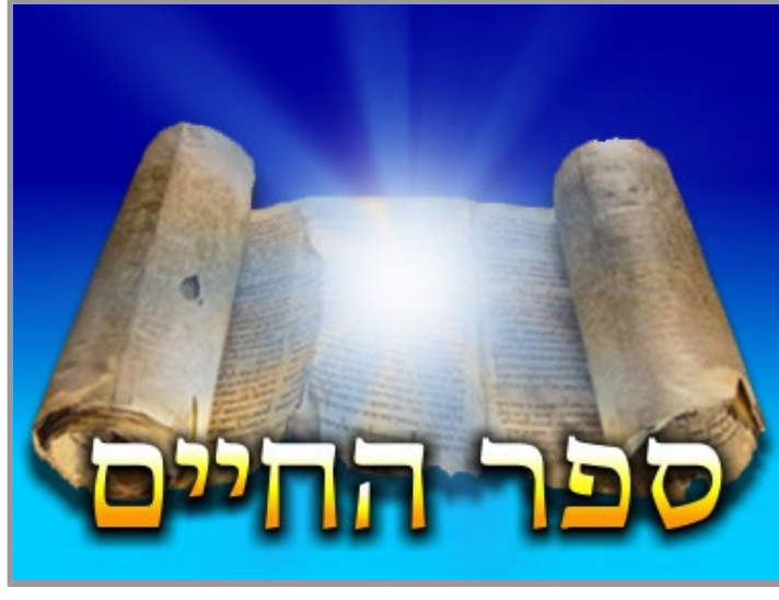
...sefer hachayim (the Book of Life)