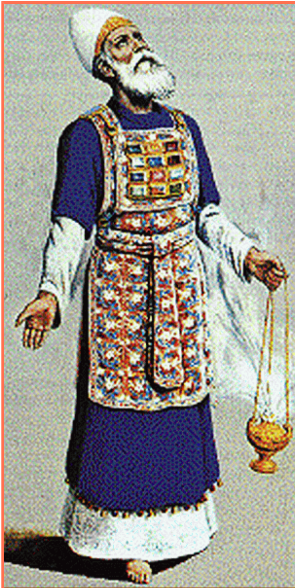
the clothing of the High Priest

the beginning of this article is not inspired by the garb of a Roman soldier, but came from its Hebraic root in the Original Writings as the clothing of a priest described in Exodus 28 as a picture of the Whole Armor of YHVH . Because of the Greco/Roman influence that crept into Christianity centuries after the Resurrection, these words have been taught to picture a Roman soldier's armour; but when studying these scriptures with the Hebrew perspective they were written from based on the Torah, a totally different picture appears. The word "priest" is translated from the Hebrew kohen , always denoting one who offers sacrifices and first occurs in Genesis 14:18 as applied to Melchizedek . 1Peter 2:9 and Revelation 1:6 tell us that those who actively embrace the Life of Yeshua by keeping the words of the Father are now under the Melchizedek priesthood alongside that of the Elder Brother, Yeshua - continually offering sacrifices of praise and thanksgiving ( Hebrews 7:1-10 , see a Nation of Priests ). The priesthood has not been eliminated - merely elevated into a higher place of Spirit. While the priesthood of the Levite could only be attained through birth, the apostle was hearkening to the shadow expressed in the clothing worn by those priests of what is to be put on by His holy priesthood who stand before YHVH today in Ephesians 6:11-18 :