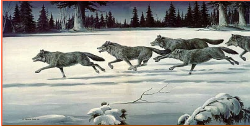
...like a pack of wolves

"The earth belongs to Satan" is another popular catch-phrase of Christian tradition used to facilitate assumption of some battle being fought over it - even though Exodus 19:5 clearly shows YHVH saying that "the earth is Mine". Nowhere does scripture bestow ownership of earth upon anyone other than YHVH - mere possession of something does not constitute ownership. We have to look at everything mentioned in scripture through the lens of Yeshua's Hebrew Words whose origins are found in the Original Writings in order to understand Truth - Who is YHVH ( Exodus 34:6 ). There is nothing, and let us be clear on this issue - nothing - Yeshua said that cannot be traced back to the Original Words of His Father in the Tanakh (OT - John 5:19, John 8:28, John 14:24 , see the Beatitudes for more). Most assuredly, there are demons active among us. Yeshua dealt with them all the time. They are often found in packs, like wolves, seeking a vessel to inhabit ( Matthew 8:30-32 ). As with wolves, while there may be one demon more dominant than the others within the pack, in spite of traditional dogma - there is no scriptural account to be found of a central, controlling entity coordinating the efforts of a worldwide hierarchy of demons (see Defining Enemies for more insight). They are very crafty, however, appearing as an